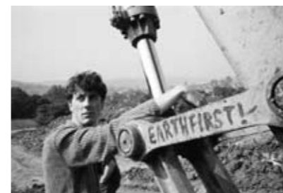
1994 George Monbiot (top) and Paul Kingsnorth (below) at Solsbury hill.

On a fine day in May 1994 two over-dressed policemen struggled up to the camp on Solsbury hill. Averting their eyes from a naked woman stretched out in the sun, they asked to be taken to the leaders. "You want to talk to Aqua and Sulis", someone told them. "They're up the top. You'll recognise them 'cos they're both black."