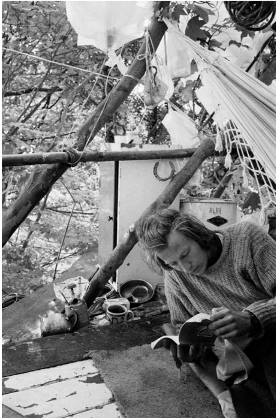
June 1994 Whitecroft woods Much of life in the trees was spent reading ...