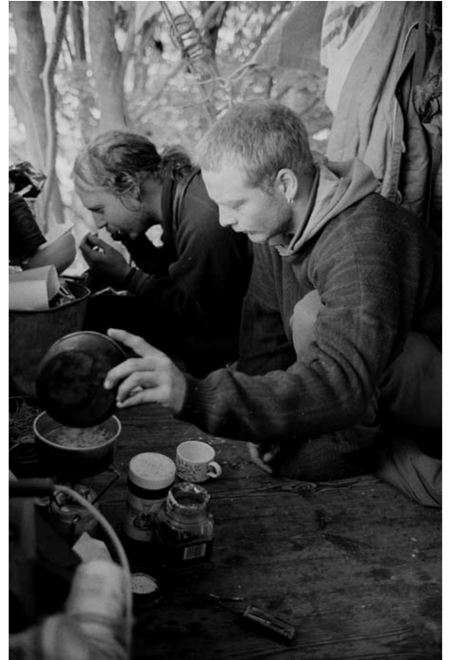
June 1994 ... and drinking tea.