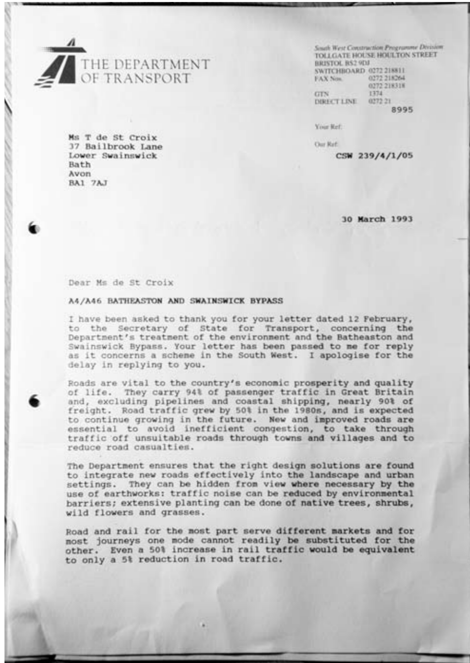
March 1993 A letter from the Department of Transport to one of the campaigners against the road.