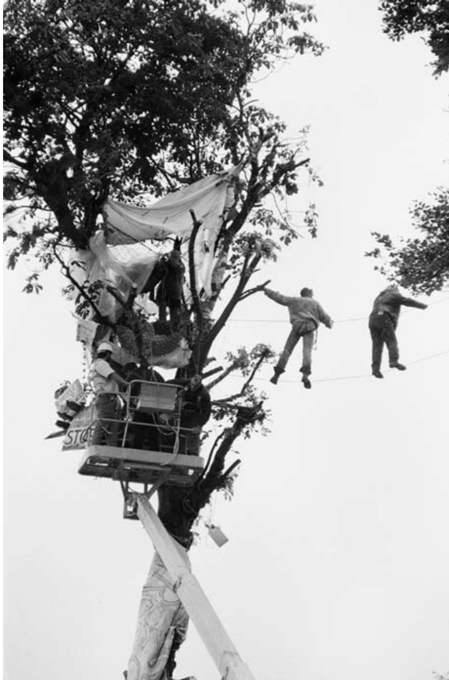
July 1994 Whitecroft woods Protesters risked their own lives playing a game of cat and mouse on the walkways, challenging bailiffs to cut the ropes whilst people were on them.